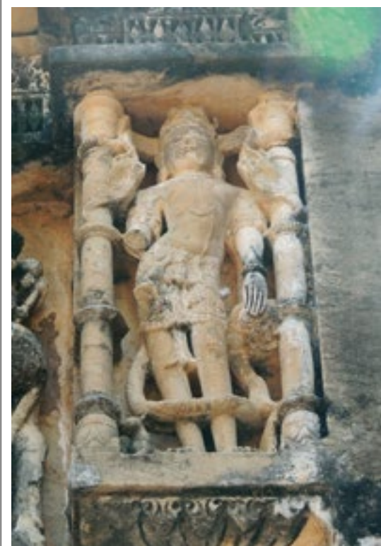
Opposite page, top: Vishnu and Lakshmi on Garuda, on the base; bottom: a sculpture of the Dancing Shiva