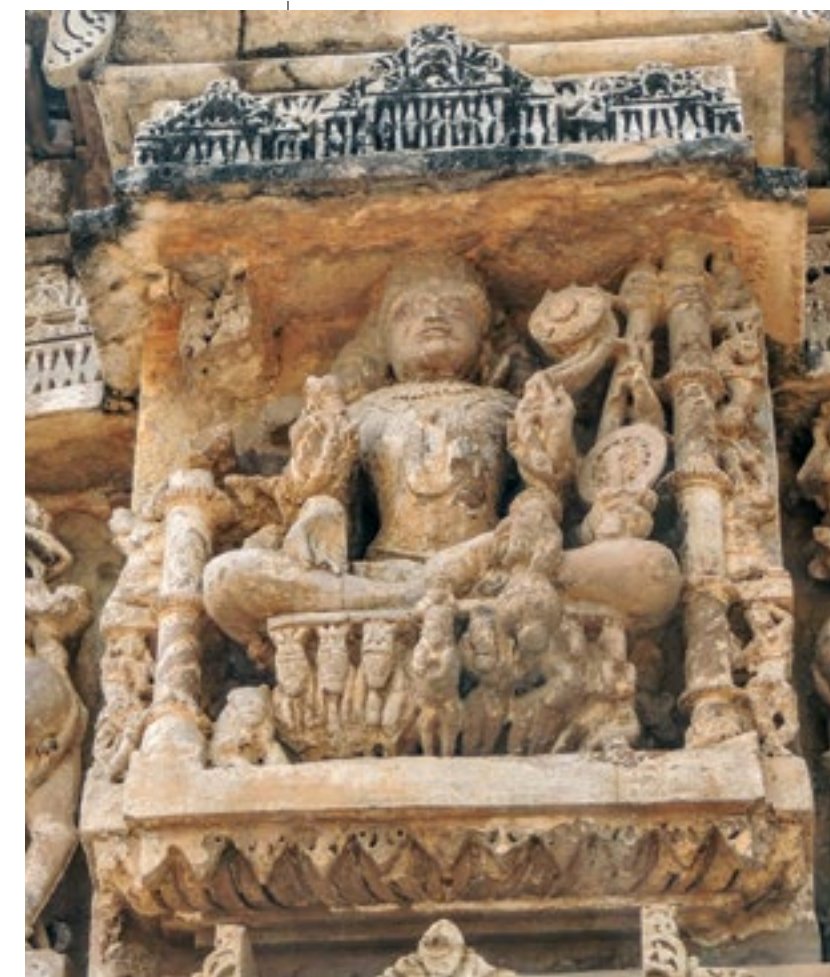
This page, clockwise from left: Tripurantaka on the south wall; Hari Hara Pitamaha Arka on the eastern wall; a shed outside the temple with several sculptures